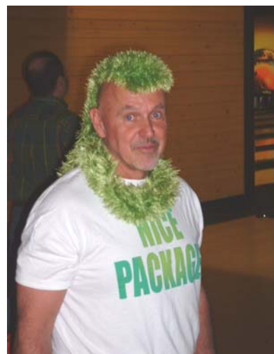
Faith's Youth Counselor – Kyrie Eleison!

Warning: The youth are having more fun than Lutherans are allowed!